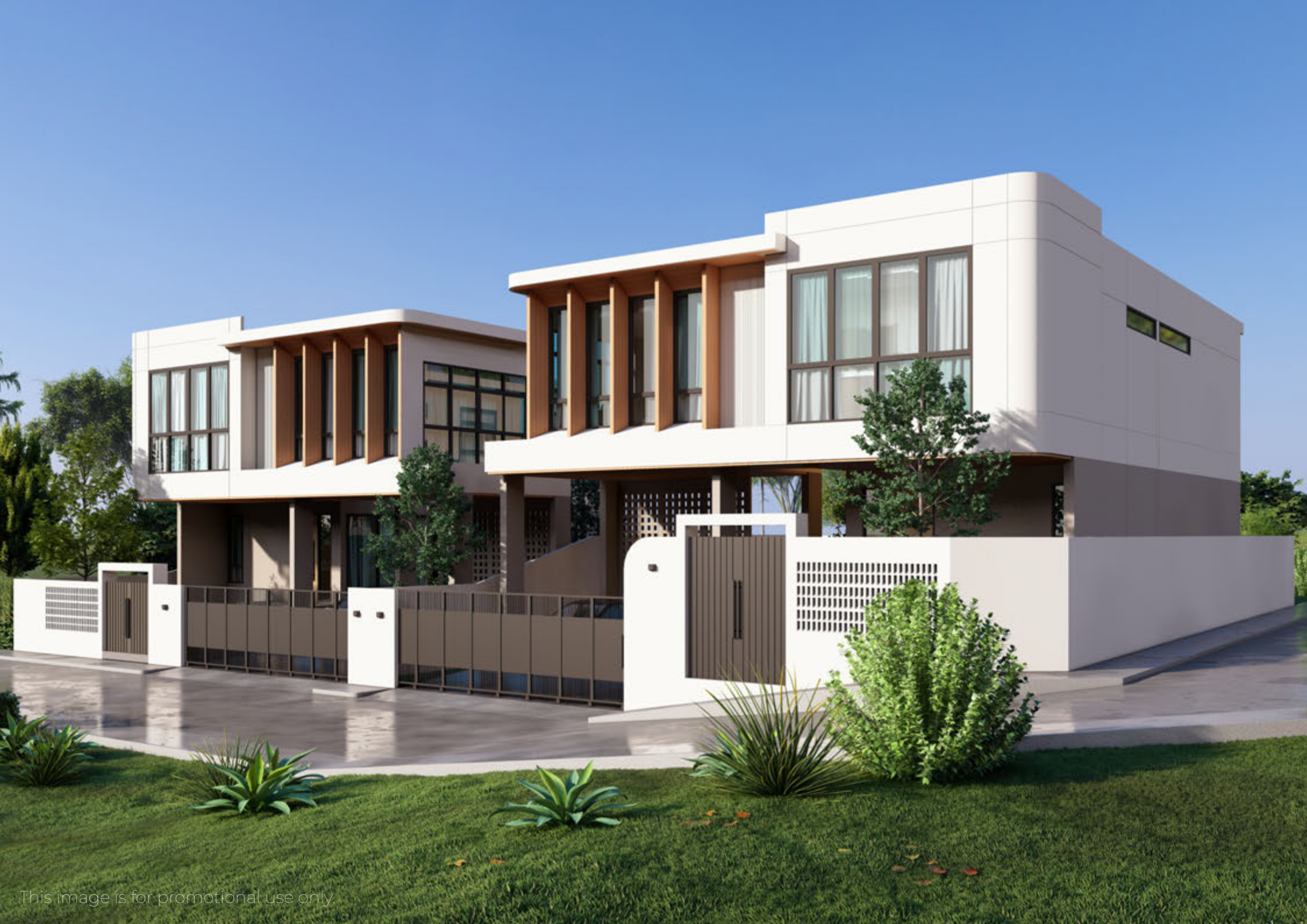
This image is for promotional use only.