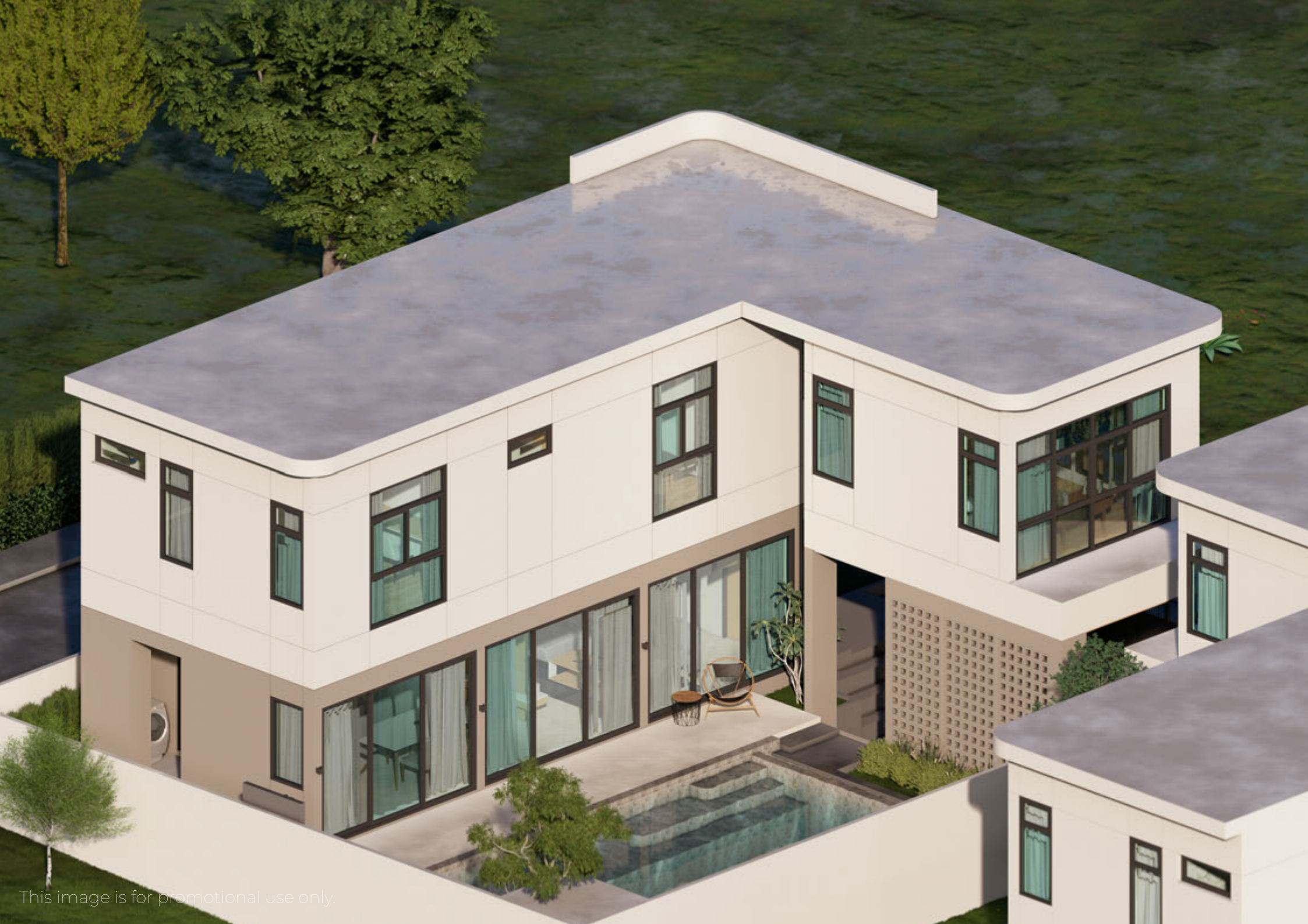
This image is for promotional use only.